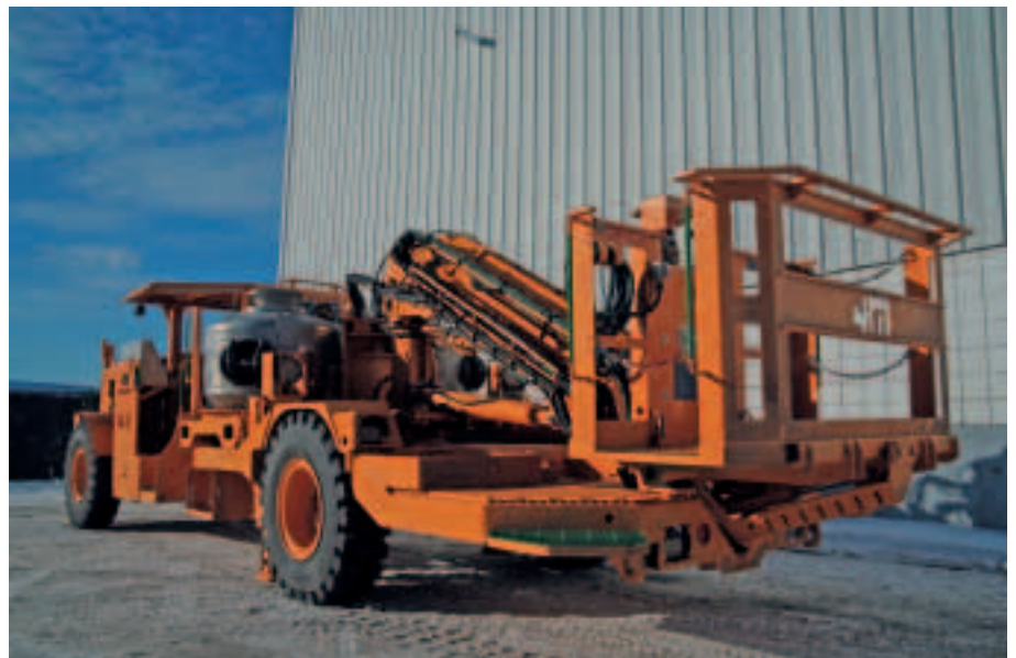
MacLean AC3 ANFO charger with canopy

The PC3 personnel carrier features nitrogen gas-powered gas shocks and isolation mounts on the suspension system to provide a comfortable ride over harsh terrain. The SL3 scissor lift features forward and side-shift deck capabilities and a Remote Drive System (RDS); the latter allows the operator (while working from the elevated scissor platform) to reposition the vehicle. The CS3 cassette system is available with eight different cassette options, all married to one standard carrier. The BT3 boom truck is available with a Magnum® crane option; this crane is specially designed to fold up off the deck maximising deck space and minimising tramming height. The AC3 ANFO charger's compact multi-stage extension boom has a 2-person basket, with retractable canopy and basket swing feature to maximise face coverage. All MacLean UTVs are