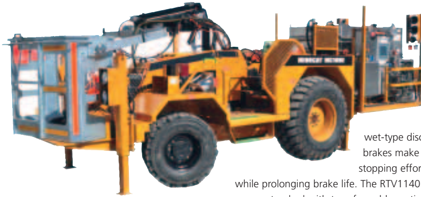
The new Minecat MC100E emulsion/ANFO carrier

built on the Mine-Mate™ carrier, offering common components to simplify and facilitate maintenance, parts stocking and training for customers.