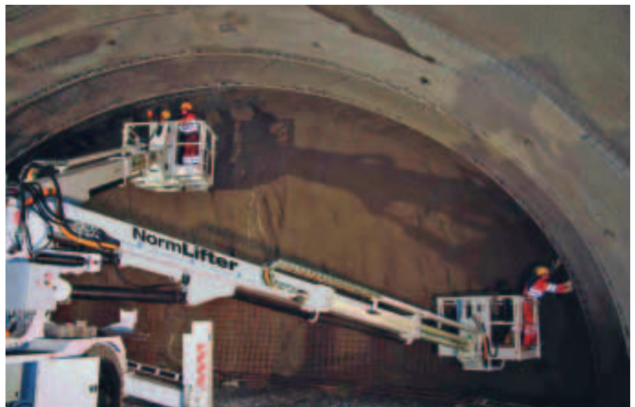
The double boom NormLifter from GTA in action in a tunnelling project

Based on their experience with platform-mounted booms, GTA together with NormRent have developed vehicle mounted working platforms for heavy loads and for extreme long reach, complying with the needs of large