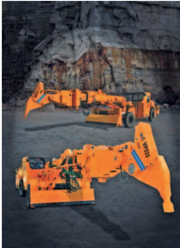
The VPS16 and VPS 25 series mobile scalers from BTI

Since 1979, Marcotte Mining Machinery Services has had a long and productive relationship with operators throughout the mining industry and specialising in underground utility vehicles. Marcotte's core offering is the Minejack® carrier which is the