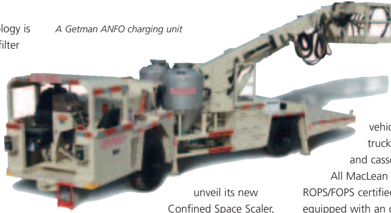
A Getman ANFO charging unit

unveil its new Confined Space Scaler, capable of working in 3.5 m drifts, later this year. In addition, Getman also offers a range of knuckle boom crane trucks, personnel carriers, fuel and lubrication trucks and water spray trucks, all built on the basic A64 Carrier.