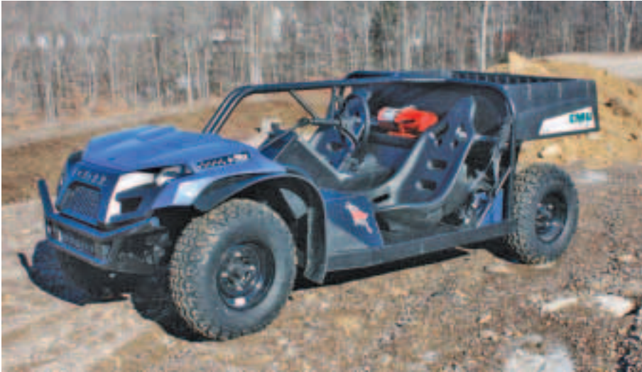
The EMU-LR from Pillar Innovations seats two miners in full gear

available with dedicated specifications matching international standards for use in hard and soft rock mining, in either controlled or explosive conditions. The range includes standard and flameproof models with a large range of options to match the specific needs of every single mine. Cabin protection and reinforcement, specific light ramps, engine protection, fire suppression systems are examples of the options offered. Flameproof telehandlers and skid steers are available and a new generation of models is in the final phase of development to keep ahead of safety requirements.