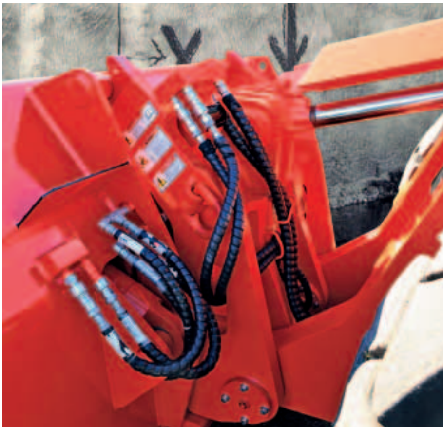
The Sandvik Quick-Detachable-System (QDS) on an LS191 coal loader

tunnel cross sections. The overall product line is called NormLifter.