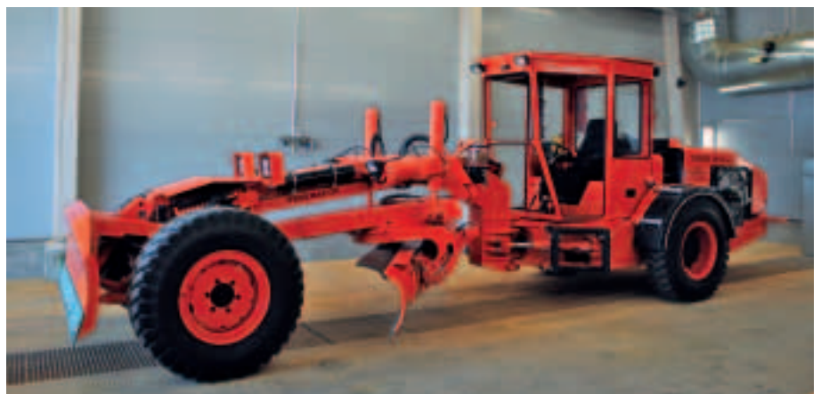
FG 7 C is a low-profile motor grader specially designed for continued use in underground conditions.

The three main families of Manitou Group products used in mining are the skid steers, rough terrain forklifts and telehandlers – all