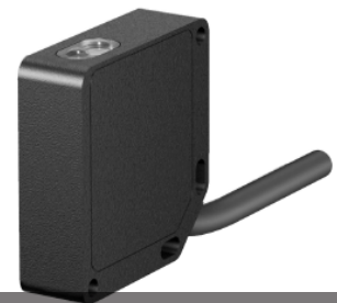
Vibe/Temp Sensor Block