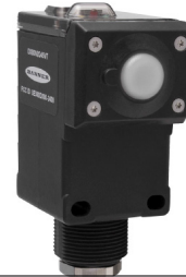
Radio with Alarm Indicator