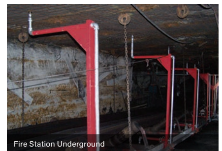
Fire Station Underground